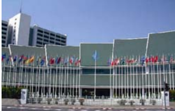
United Nations Conference Centre Bangkok, Thailand June 2010

This conference is being jointly organized by the Center for Global Trade Analysis, United Nations Economic and Social Commission for Asia and the Pacific, Asia-Pacific Research and Training Network on Trade, Poverty and Economic Policy Research Network and the South Asian Network on Economic Modeling.