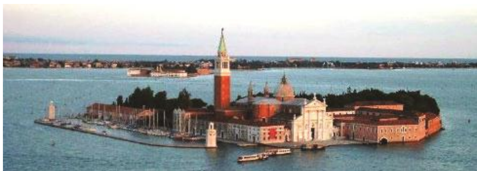
Venice, Italy June 2011