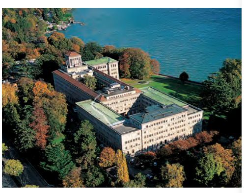
World Trade Organization June 27